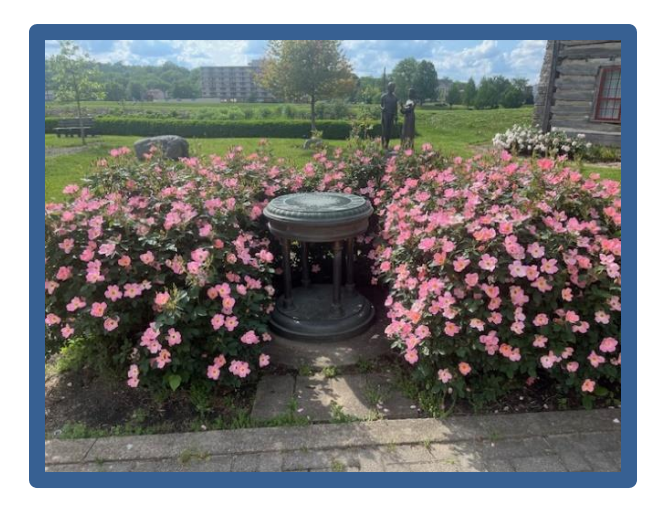
The G.A.R. Sundial Now Under Restoration to be Returned to Monument Park and Rededicated in the Late Spring of 2025